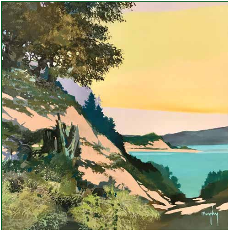
Charles Murphy's "Dune Bluff," Acrylic, 40 x 30